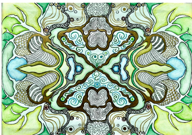
Mim's Zentangle art from " I Can't do Art Group "